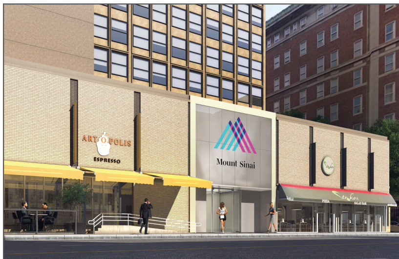
Artist's rendering of the new ambulatory pavilion at Amsterdam Avenue and 114th Street

Development of the new pavilion will occur in three phases. During the first phase of construction—to be completed during the second quarter of 2018—the hospital will open its integrated primary care practice, as well as a full-service cardiology practice, and medical