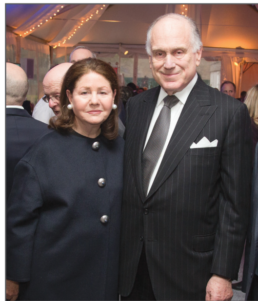
Jo Carole and Ronald S. Lauder

"With nearly 2,000 admissions a year, the NICU serves as the hub for the Pediatrics